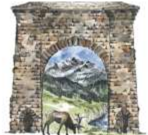
GARDINER, MT CHAMBER OF COMMERCE

As the days noticeably start to get longer and the temperatures warm, many of us have our minds preparing for the upcoming "busy summer season". We have many opportunities and activity going on in our Chamber and awesome little town at the North Entrance to Yellowstone National Park.