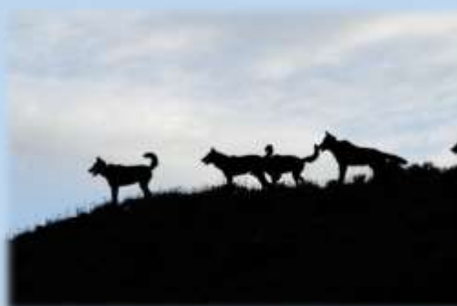
Exceptional Bus and Van Tours