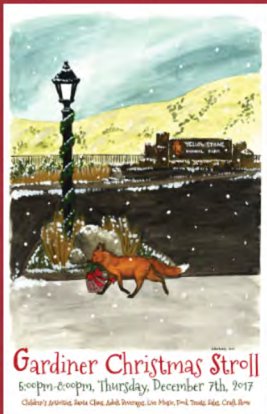
2017 Poster Contest Winning Design

Please submit your original artwork or design to the Gardiner Chamber of Commerce. Judging will be by a committee or may be opened to the public. The Chamber will retain the winners original artwork for possible future use. Artists do not need to place text. Questions? Contact the Chamber at 406.848.7971 or info@gardinerchamber.com