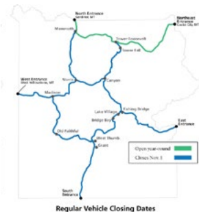
Regular Vehicle Closing Dates

Be prepared – there are several major road construction projects in YNP this year that may effect your journey into the park. All projects will cause 20 - 30+ minute delays . Projects scheduled to last through October 31, 2023 are located at the intersection of NE Entrance Rd. & Tower Junction, Lamar Valley (NE Entrance Rd.), between Biscuit Basin and Grant Village (Grand Loop Rd.), and Lewis River Bridge (South Entrance Rd.). Don't be negligent - plan ahead, learn more about current YNP road status by scanning the QR Code.